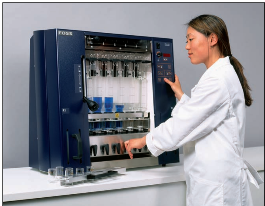
A semi-automated extraction system for simple determination of crude fibre, detergent fibre and related parameters in plant materials, compound feeds, foodstuffs etc.

introduced by van Soest in the 1960s. Neutral detergent fibre is the fraction that remains after solubilization of non-fibrous components with a neutral detergent solution. This fraction contains 100 per cent of the indigestible plant material. On the other hand some soluble fibre, i.e. material that is not digested by mammalian enzymes, is obtained. However, neutral detergent soluble fibre is often fermented by bacteria and digested